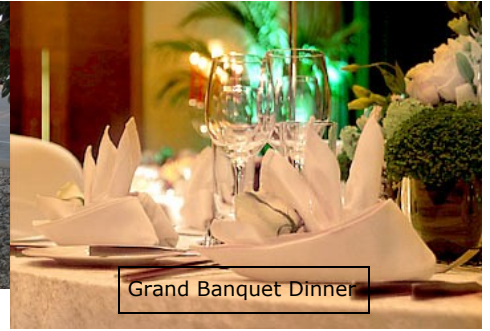
Grand Banquet Dinner