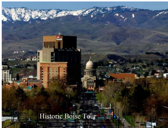
Historic Boise Tour