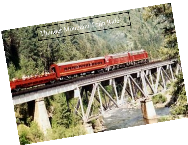
Thunder Mountain Train Ride