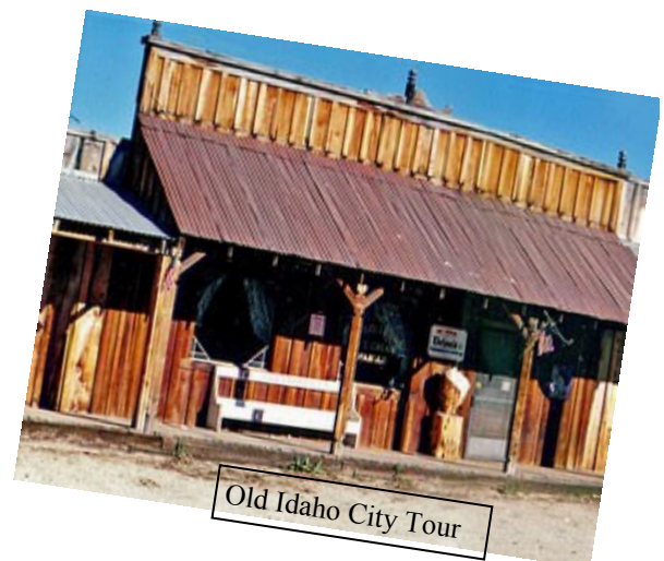
Old Idaho City Tour