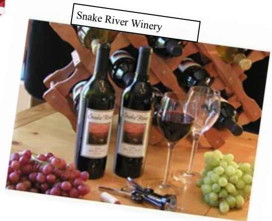
Snake River Winery