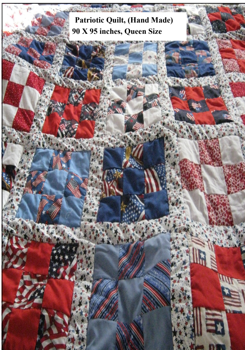
Patriotic Quilt, (Hand Made) 90 X 95 inches, Queen Size

The U.S. Department of Veterans Affairs has announced a new online feature that allows active duty and retired servicemembers to access their electronic health records (EHRs) online. The VA's "Blue Button" Web Portal gives veterans direct access to the agency's MyHealththeVet personal health record on any computer, including mobile devices. Blue Button capability allows VA patients to download and also share their healthcare records with medical providers. For more information, visit my-health.va.gov .